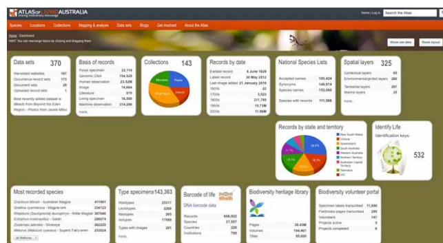
ALA's new data dashboard

Another new development on the ALA site is a data dashboard, which provides a quick summarized view of available records. The dashboard can be accessed at http://dashboard.ala.org.au/ .