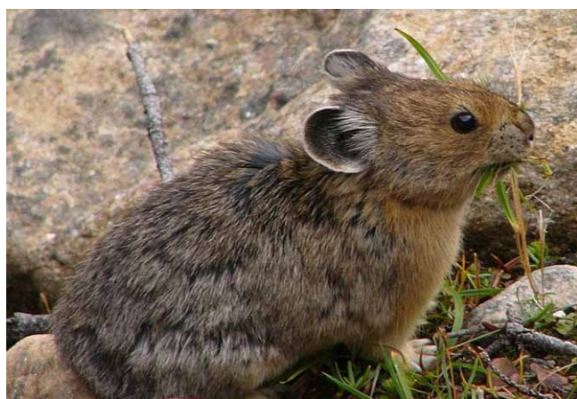
American pika ( Ochotona princeps )

The New Mexico Museum of Natural History and Science published over 6,000 records of small mammals primarily from southwestern United States and Mexico ( http://data.gbif.org/datasets/resource/14136 ).